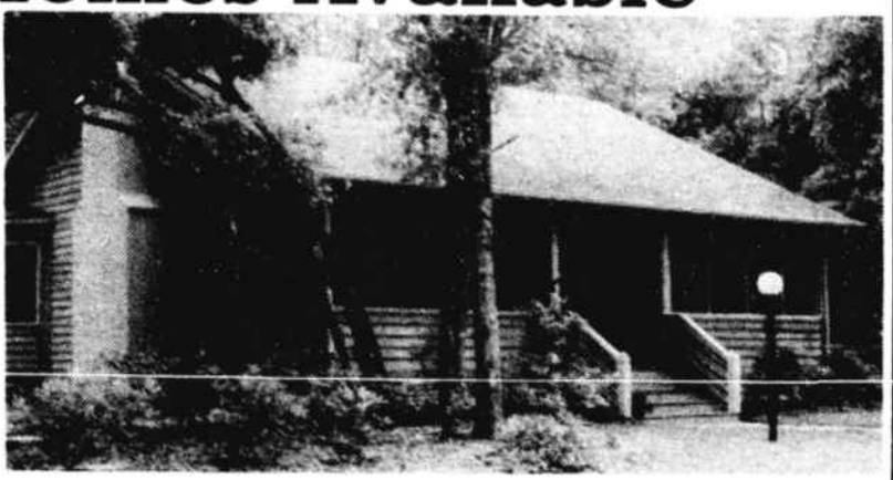
3-BR, 2-bath home with large brick wall with fireplace and 2 screened porches. $92,900.