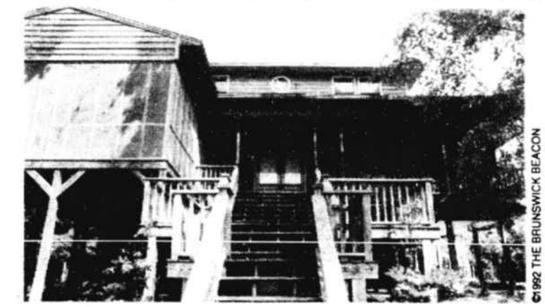
Beautiful low-country style has 5 BR, baths, large ground level storage. 3000+ sq. ft., deck around with 2 screened porches. $179,900.