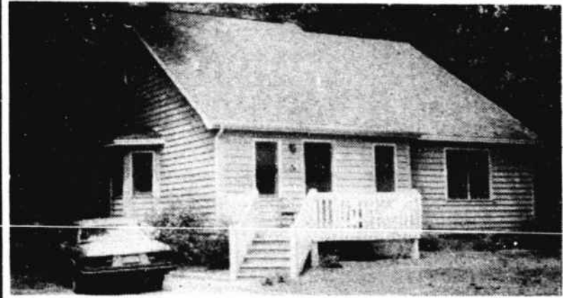
3 BR, 2 baths, loft, 1500 sq. ft. $84,900. Contact Century 21 Sunset Realty, 579-1000 or call 754-9265