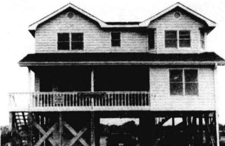
686 OBW —Second Row. New home! 4 BR, 4 baths, fully furnished, fantastic view of marsh, waterway and ocean. Easy access to beach. $189,500.