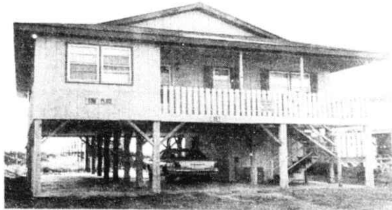
159 OBW —Oceanfront, 4 BR, 2 baths, excellent condition, great value at $189,500.