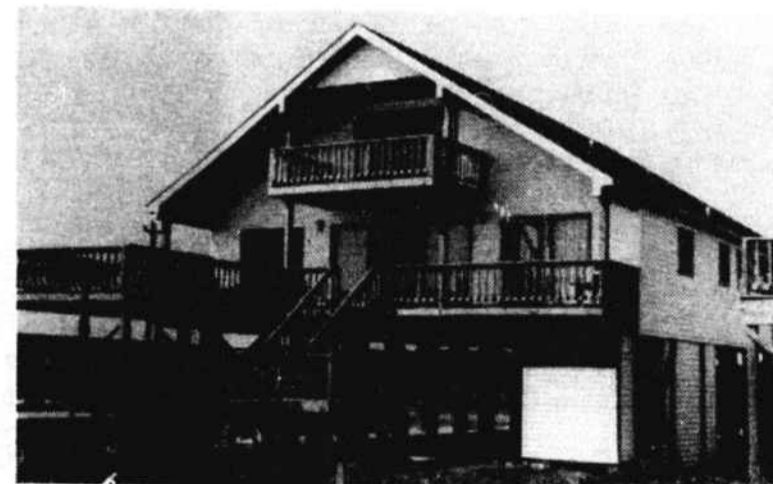
749 OBW —Oceanfront. New home! 4 BR, 4 baths, den, exquisite decor plus many extra amenities. $299,500.