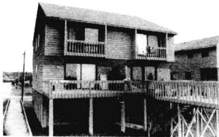
1155 OBW —Oceanfront. 6-BR, 4-bath duplex, fully furnished. Great location with super rental history $299,500.