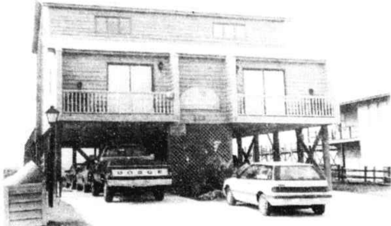
329 OBW —Unit A—Oceanfront 3 BR, 3 baths, Jacuzzi, beautiful decor. All for $198,500.