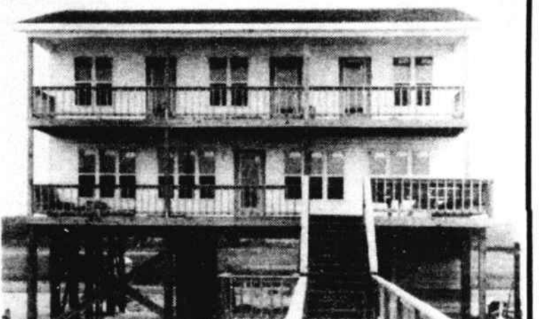
669 OBW —Oceanfront. New, 4 BR, 4½ baths, extra den, beautiful decor. $295,000.