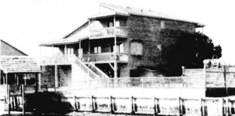
168 Greensboro St. —Beautiful Waterway/Canal home. 3 BR, 3½ baths, situated on 2 lots, swimming pool, boat dock and many extras. $385,000.