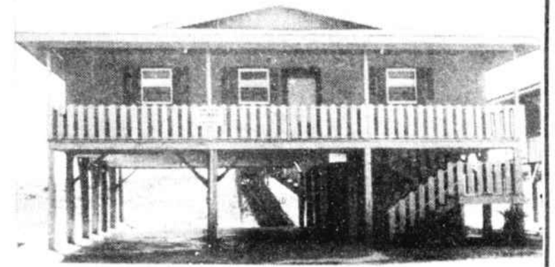
527 OBW —Oceanfront, 4 BR, 2 baths, remodeled, furnished, great rental history. $205,000.