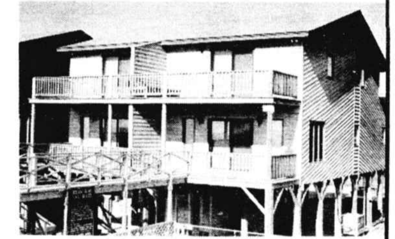
769 OBW —Oceanfront. Ocean Palms townhouse units. Each 3 BR, 3 baths, beautifully furnished, pool. Unit 769-A $172,500; Unit 771-A $169,000; Unit 773-B $169,000; Unit 775-A $170,000.