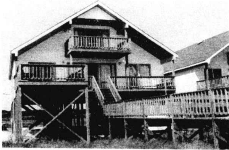
637 OBW —Oceanfront—New home! 4 BR, 4 baths, den. Excellent rental in 1991. $249,500.