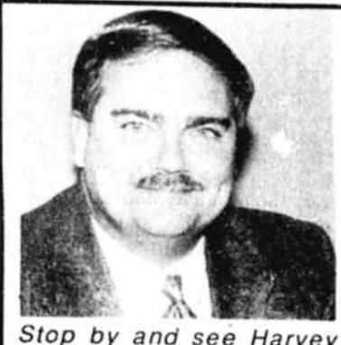
Gaskins at Jones Ford in Shallotte. We have a large selection of new and used