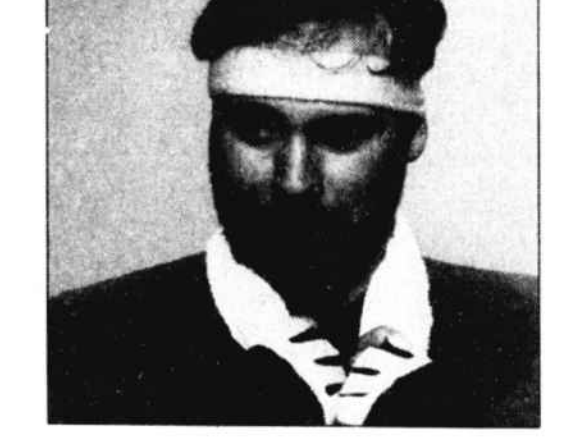
I'm just out of breath. I'll be fine in a minute.