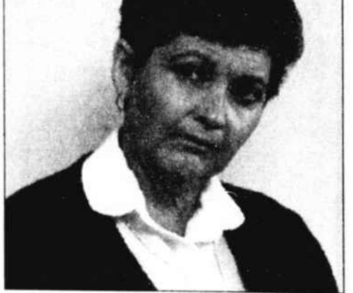
It's stress, that's all. I just need to relax.