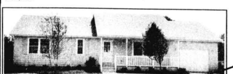
Meadow Drive, Forest Lake Estates —This budget conscious 3-BR colonial-styled ranch makes the perfect starter home for a young family. Quality throughout but at an affordable price, it's ideal for retired folks too.