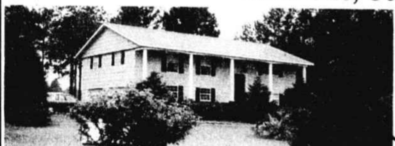
Wendy Lane —Beautiful 4-BR, 3-bath home on the 18th green. Bi-level home with downstairs suite that would make a perfect "mother-in-law" apartment or teenagers room. (LH19790) $110,000.