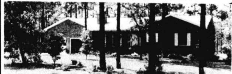
32 Fairway Dr. —Spacious 3-BR, 2-bath brick rancher in excellent condition. Landscaped lawn has sprinkler systems in front and backyard. Deck off large Carolina room overlooks the #2 fairway. (LH16190). Reduced $6,400 to $138,500.