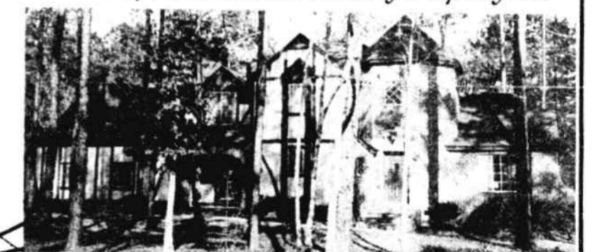
Nicklaus Ct. —Stately 3-BR, 2-1/2-bath English Tudor has manicured laws. Two story foyer, whirlpool tub in master bedroom gourmet kitchen, large dining room and much more. (LH25991) Reduced $10,000 to $159,950.