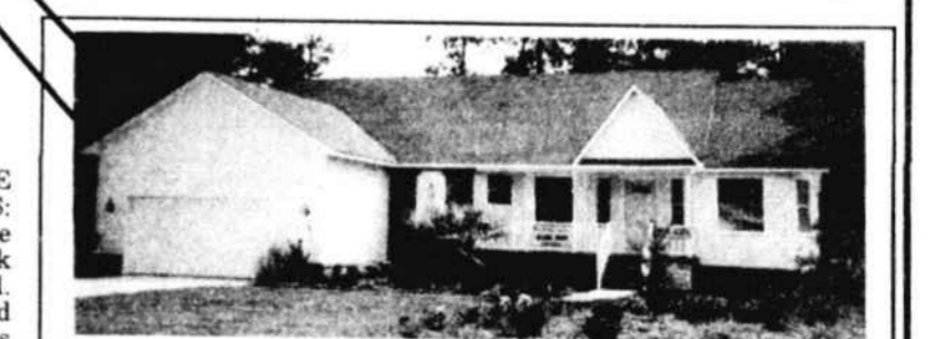
79 Country Club Drive —This 3-BR, 2-bath home offers comfort and style. A fireplace in the great room adds charm, while overlooking the fairway at beautiful Brierwood Golf Club.

We also have a wide range of homesites available for your viewing.