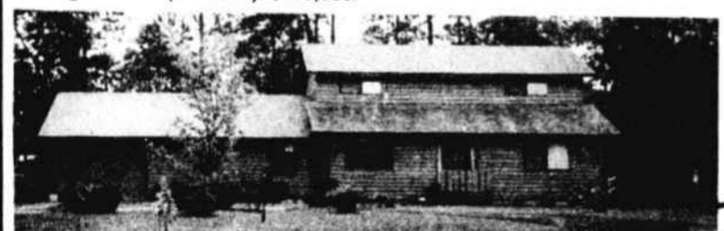
15 Country Club Dr. —Immaculate colonial situated on the 2nd fairway. 3-BR, 2-bath home has over 2,000 sq. ft. This home has many extras...custom kitchen cabinets, deck off master bedroom overlooking fairway, beautifully landscaped, security system and much more. (LH24891) $138,500.