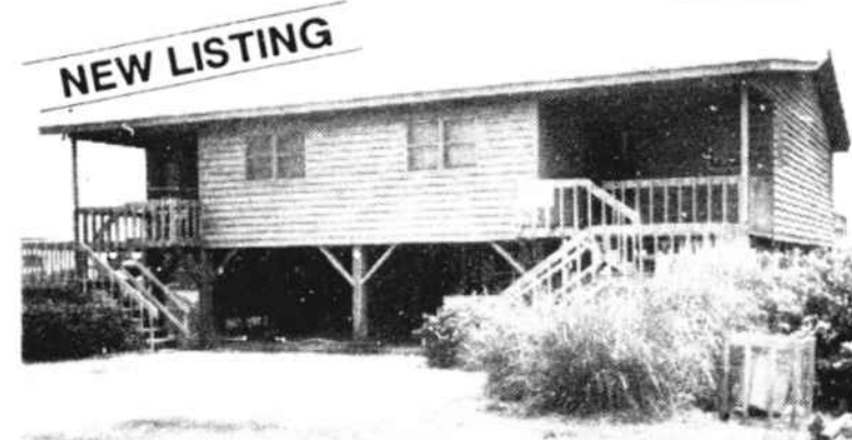
309 West Brunswick Avenue —Dune, 2 BR, 1½ baths. Well-maintained attractive duplex. C/H/A, dishwasher, front and back porch. This unit has a nearly unobstructed view of the Atlantic ocean. Excellent rental potential! $69,500.