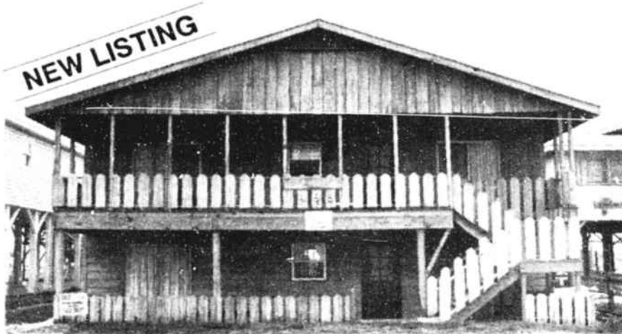
493 Ocean Blvd. West —Oceanfront duplex. Up has 4 BR, 2 baths, 2 covered porches, sundeck with boardwalk to beach. Excellent rental! Down has 3 BR, 2 baths. $189,000.

OCEANFRONT LOTS 735 OBW...$129,000. 108 OBW...$135,000. SECOND ROW LOTS NEW LISTING! 376 OBW.....$55,000. NEW LISTING! 378 OBW—corner lot tank in ground.....$59,000. 942 OBW.....$55,000. 1086 OBW....$59,000. 1092 OBW....$59,900. 1084 OBW....$59,900. 1090 OBW....$59,000. CANAL LOT NEW LISTING! 125 Fayetteville St....$55,000. WATERWAY LOT NEW LISTING! 125 South Shore Dr...$87,500. DUNE LOTS NEW LISTING! 113 Seagull.....$34,500. NEW LISTING! 105 Seagull.....$34,500. DEAL SUBDIVISION DUNE LOTS #7-#26.....from $36,000 to $69,900. **Beach access across street from Deal Subdivision** SHALLOTTE LOTS Commercial lot approx. 175x325. Hwy. 17, near Wal-Mart. For sale or lease. Will build to suit! Call for details. ATTENTION PROPERTY OWNERS Now is the time to check out Sand Peddler's quality service and low management rates for 1994.