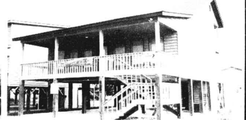
193 Brunswick Avenue —Dune, 3 BR, 2 baths, carpet and vinyl floor coverings. C/H/A, dishwasher, covered porch, sundeck, easy beach access. $129,500.