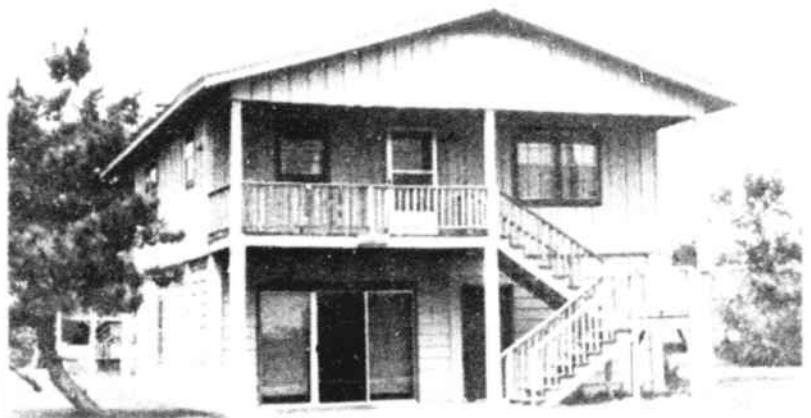
131 Swordfish Drive —Canal, 3 BR, 2 full baths, C/H/A. Outside shower, covered porch, sundeck, and a floating dock. This home has undergone extensive renovations by its proud owners. Excellent rental! Offered at $129,000