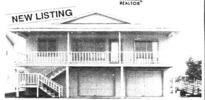
184 Greensboro St. —Canal, 3 BR, 2 baths, C/H/A, dishwasher, ceiling fans, front and back porches, sundeck, NEW floating dock, garage, spectacular waterway view, NEW vinyl siding. $159,900.