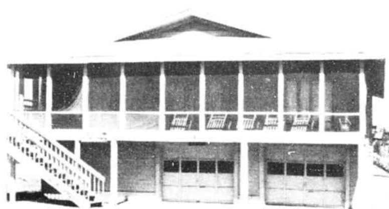
940 Ocean Blvd. West —Second row, 4 BR, 2 baths, C/H/A, dishwasher, screened porch, 2-car garage and a sundeck. Home has a lot of potential. Easy beach access and an excellent rental property!! $129,000.