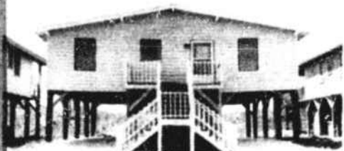
220 E. FIRST ST. —Oceanfront, 4 BR, 2 baths, C/H/A, new roof, furnished. $265,000.