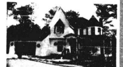
BENTTREE PLANTATION —Victorian, 3 BR, 2½ baths, fireplace, landscaped, restricted subdivision with amenities. $173,000.