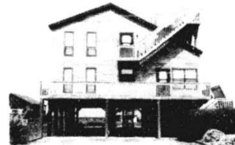
16 PENDER ST. —5 BR, 2½ baths, C/H/A, furnished. $229,500.