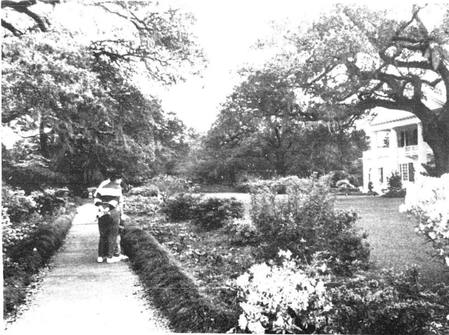
A CLASSIC PLANTATION HOME built in 1725, Orton Plantation is surrounded by 20 acres of azaleas, magnolias, camellias, and other varieties.