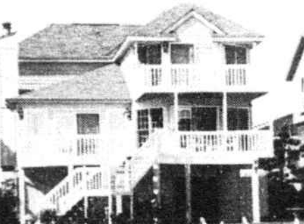
Raeford St. (Ocean Isle 10 Beach)-Canal. Prestigious executive home. 3 BR, 2 full and 2 half baths, formal living and dining rooms, den and game room. Well for irrigation, floating dock and extensive landscaping. $247,500.

Craven St. (Ocean Isle Canal). Great buy. 4-BR + loft, 3-bath home on the waterway. 2-story home with large family room/game room. Large kitchen, living room with fireplace. Floating dock, sundecks, screened gazebo and more $164 900