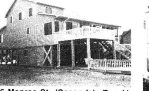
96 Monroe St. (Ocean Isle Beach)-Intracoastal Waterway! 4-BR, 4-bath private home. Beautifully furnished. $345,000.

Brierwood Golf Club-32 Fairway Dr. Spacious 3-BR, 2-bath brick rancher is in excellent condition. Landscaped