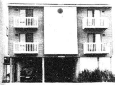
476 E. Second St. (Ocean Isle Beach)-OCEANFRONT! 4 BR plus loft, 3.5 baths. Beautifully furnished, great rental history. Oceanfront at its finest! $170,000.

Brierwood Golf Club-32 Fairway Dr. Spacious 3-BR, 2-bath brick rancher is in excellent condition. Landscaped