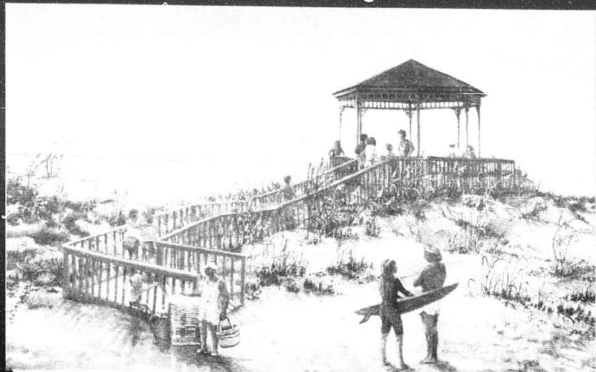
Gazebo at "Sunset Beach"