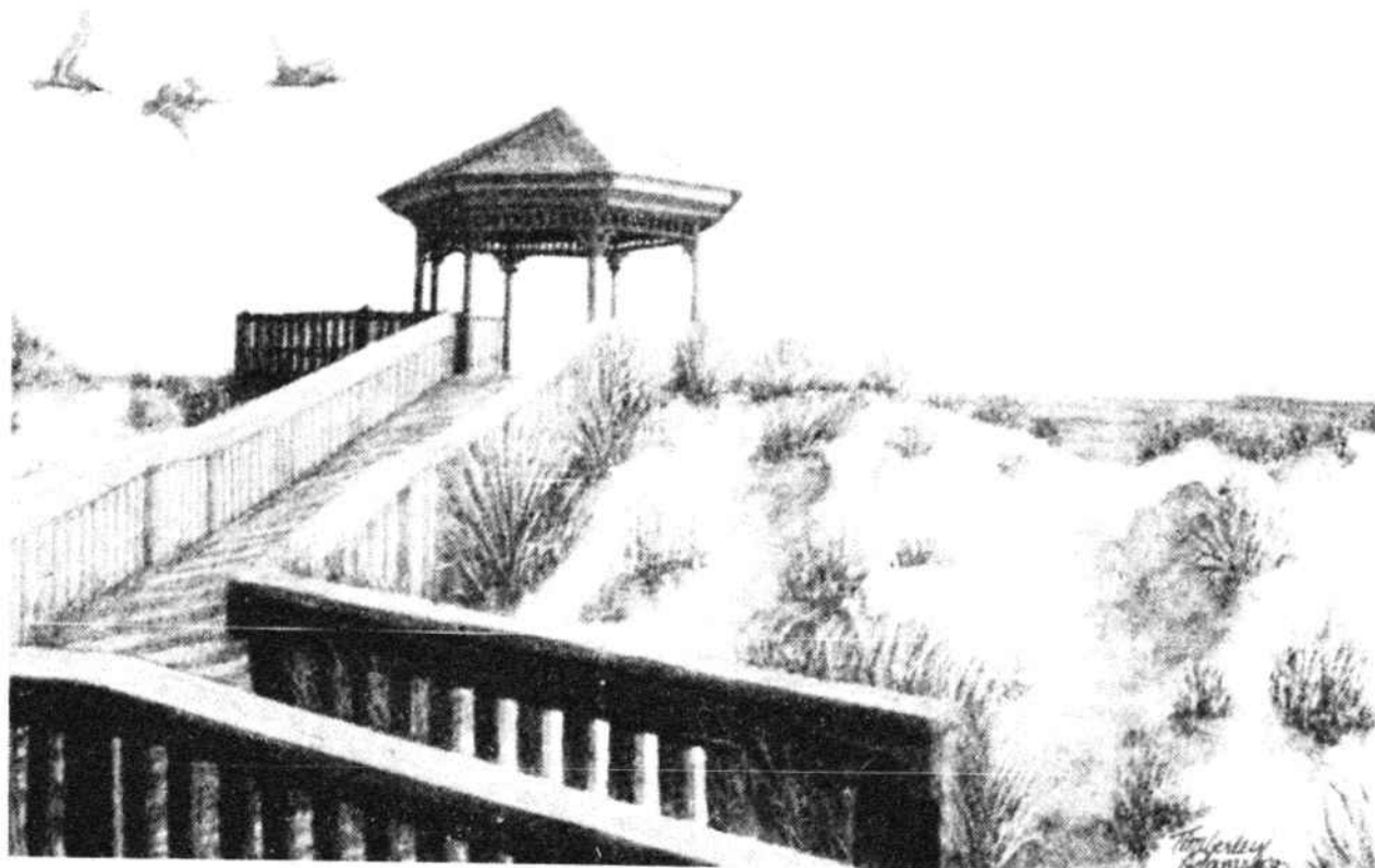
s/n 11"x14" Image Gazebo At Sunset $26 00 ©1992 T. Adams

10% to be donated to Bird Island Preservation Society & The Nature Conservancy