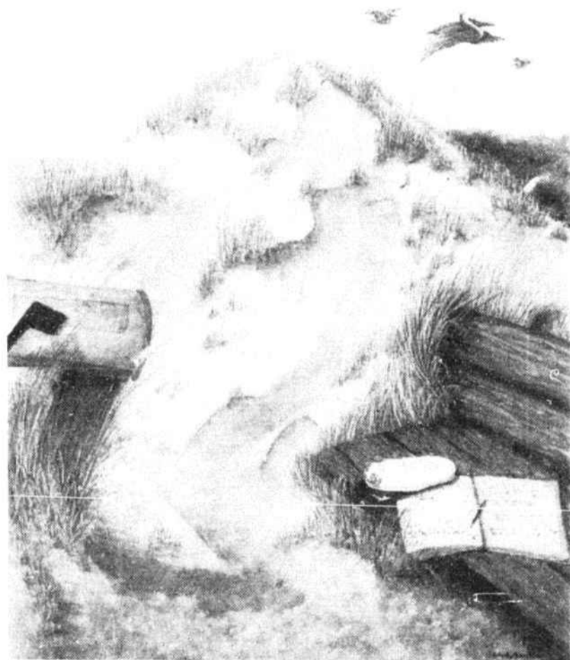
s/n 14"x20" Image Kindred Spirits $32 00 ©1990 T. Adams

Timberley Adams, PO Box 2652 Shallotte, NC 28459 Allow 4-6 weeks for delivery.