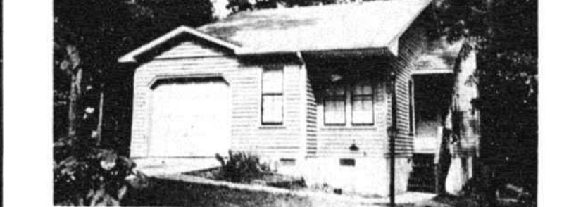
MARSH COVE— Convenient location between Shallotte and Ocean Isle. 2 BR, 2 baths, fireplace with stone hearth, bay window, ceiling fans, garage, easy assumable financing. $69,900.