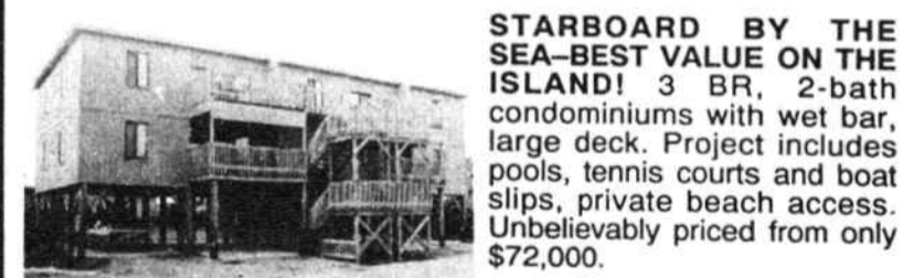
STARBOARD BY THE SEA—BEST VALUE ON THE ISLAND! 3 BR, 2-bath condominiums with wet bar, large deck. Project includes pools, tennis courts and boat slips, private beach access. Unbelievably priced from only $72,000.