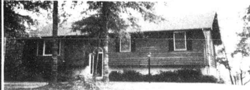
SALT MARSH CIRCLE—BENTREE PLANTATION— Beautiful 2239 sq. ft. home with 4 BR, 3 baths, fireplace and 2-car garage. Fantastic view overlooking the creek and marsh. $189,900.