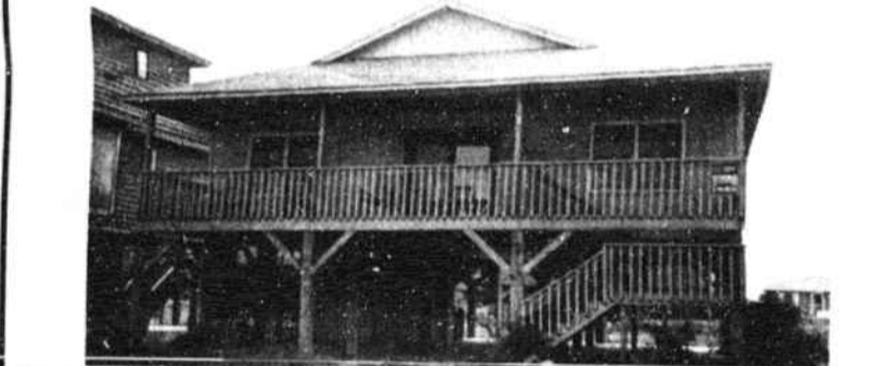
256 EAST SECOND ST.— Third row cottage with 3 BR, 3 baths. Large deck, completely furnished, easy beach access. $119,900.