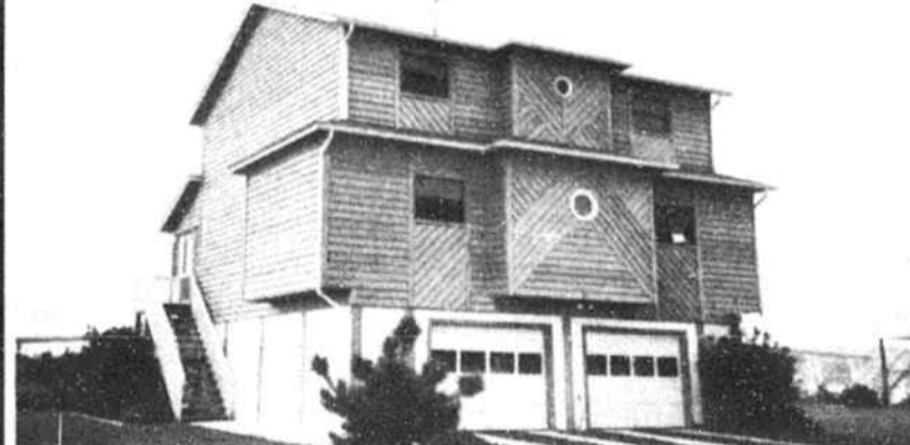
87 MONROE STREET— New listing with superb view of Intracoastal Waterway. 3 BR, loft room with sundeck, 2 large baths, extra nice kitchen, screened porch, double garage with shelves and workshop. Built for year 'round living with too many extras to list. BY APPOINTMENT.