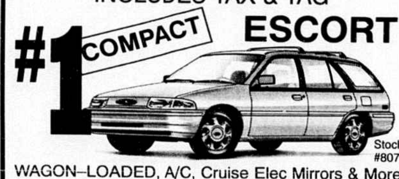
WAGON-LOADED, A/C, Cruise Elec Mirrors & More!

$187 per mo.* 24 months INCLUDES TAX & TAG