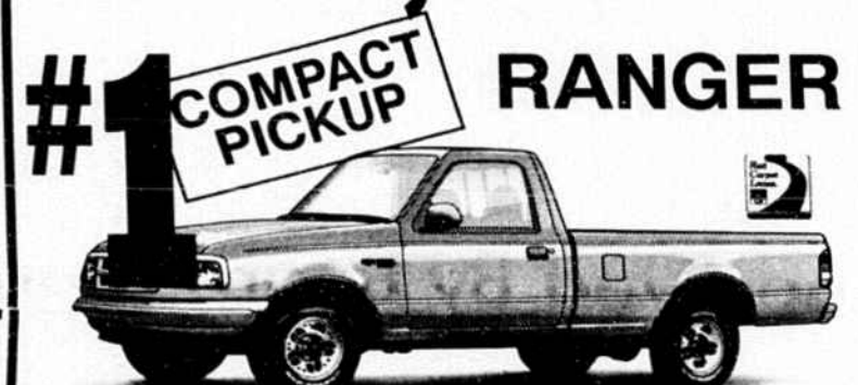
A/C, AM/FM Cass., Alum. Wheels, Sliding Rear Window

$187 per mo.* 24 months INCLUDES TAX & TAG