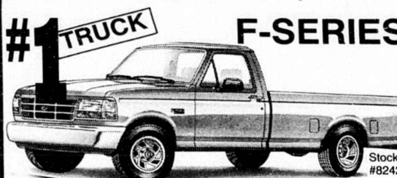
OVERDRIVE, A/C, AIR BAG & MORE!