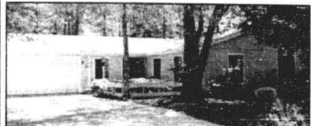
33 SWAMP FOX DRIVE —Over 1400 ht. sq. ft. on lovely treed lot. Cedar siding, 3 BR, 2 baths, lg. enclosed porch, 2-car gar. Buyer's warranty. This is a real buy. You need to see it!!! $90,999.