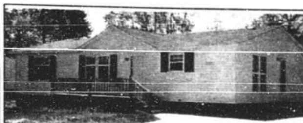
VILLAGE OF CALABASH —New manufactured home for the economically minded person. 3 BR, 2 baths, living, eat-in kitchen and more! Great location—near pool! $59,000.