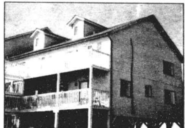
BLDG. 1 UNIT J, CHANNELSIDE LANDING —Ocean Isle Beach. Mint condition, fully furnished condo in highly desirable Channelside Landing. Pool, tennis, boat ramp and dock on creek. 1326 sq. ft. gives lots of room for vacations of full-time living. 2nd BR extra large. $99,900.

Stop By Our Office For A Complete Listing Of Properties For Sale!