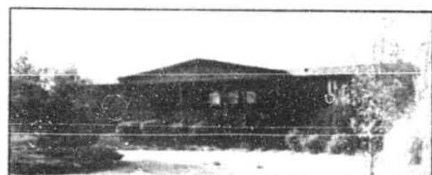
PAMPER YOUR PURSE! Live the country club life all year long. An enchanting 3-BR, 3-bath home in a community with amenities. Detached garage, fenced yard.