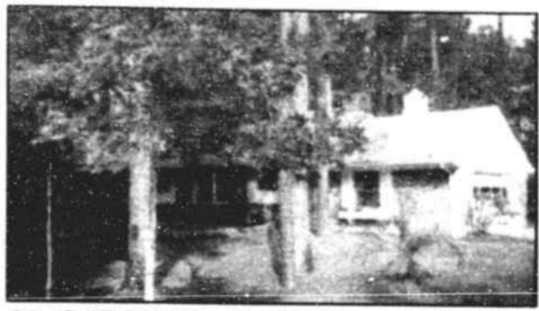
25 CAROLINA SHORES PKWY. —Large formals, beamed family room w/hardwood floors, huge master suite and 3 other large BRs. 2.5 baths, 2-car garage, eat-in kitchen with bay window, all appls. 2300 sq. ft. for only $149,900!!