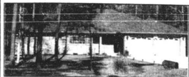
3 YELLOW JACKET CT. — Almost new brick/frame. 4 BR, 2.5 baths, 2250 ht. sq. ft., enc. porch, fam. rm., bonus rm., gr. rm., split BRs, contemp FP, many upgrades. Must see $184,900.