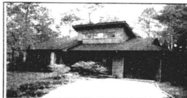
1 EGRET CT. —Fixer-upper could be adorable! Has vaulted living room with high second-story windows. Two sliders go to 10x24 patio. Would make great second home on large corner lot. $89,900.