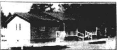
Captain Kid Drive—6 year old, C/H/A, 4-BR, 2-bath frame construction, nice back deck, front porch, range, refig., central vacuum system (not installed), large bar, approx. 1296 sq. ft. $60,000.