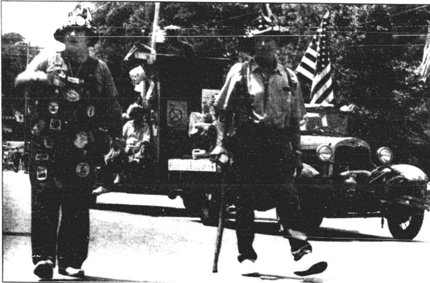
SUDAN HILLBILLIES are always a popular feature of the N.C. Fourth of July Festival parade in Southport. Festival activities begin Thursday, June 30, with opening ceremonies and culminate July 4 with the state's official Independence Day parade. Activities scheduled include Beach Day at Long Beach, dances, arts and crafts, military exhibits, displays of maritime heritage, a fun run, firemen's competition and choral music.