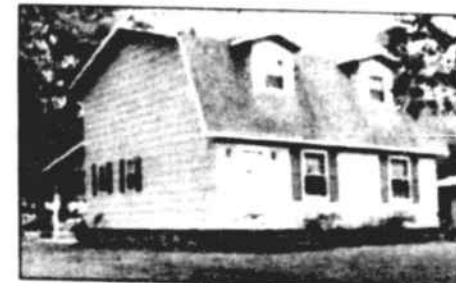
Sea Aire Estates—2-story with dormer windows, 3 BR, 1½ baths, 1568 sq. ft., county water, fireplace in living rm. with insert, built-in bookcases in living rm., wet bar, built-in stove, carport, corner lot on paved st. with trees and landscaped yard. $78,000.