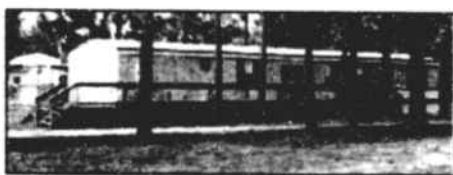
3 BR, 2 baths, 2 lots, corner, paved st. $39,900.

Overlooking Little Shallotte River. Gentle slope, has beautiful view. Septic tank & well installed. $35,000. Owner financing avail.