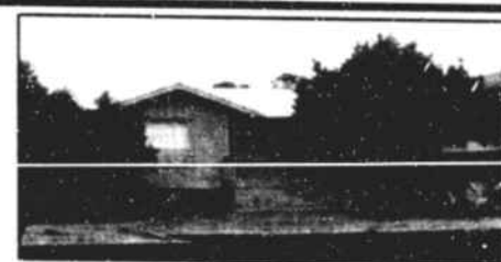
On waterway, 2 BR, 2 baths, large lot. Pier permit, county water available. $88,500.