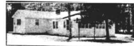
3-BR, 1-bath house with 160 ft. road frontage on Seashore Road. Large kitchen, back porch, corner lot. $45,000.