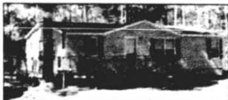
Holden Beach—1991, 3 BR, 2-bath doublewide in exc. condition. C/H/A. On 1.5 lots, front and rear decks, storm windows. $38,500.