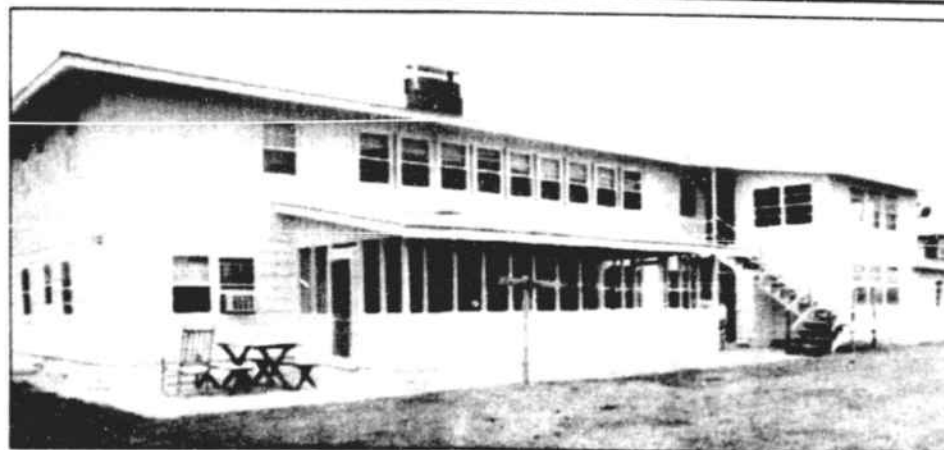
On Holden Beach—Approx. 4,600 sq. ft. of house. $195,000.

1 14x70 Fleetwood, 2 BR, 2 baths, permanent living quarters. offered at $195,000.