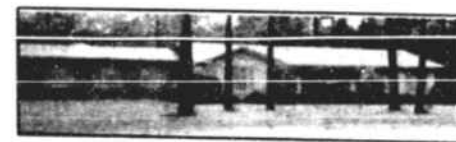
4 BR, 3 baths, brick, approx. 2900 sq. ft., fireplace (gas logs), ceiling fans, microwave oven, pull down stairs into attic, attic fan, swimming pool, located on 210x200 ft. lot. Possible loan assumption. Offered for $129,000.