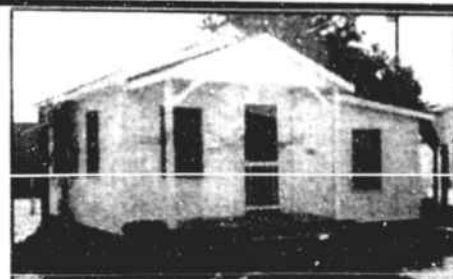
Unobstructed waterway view. 1 BR, 1 bath, county water. $40,000.