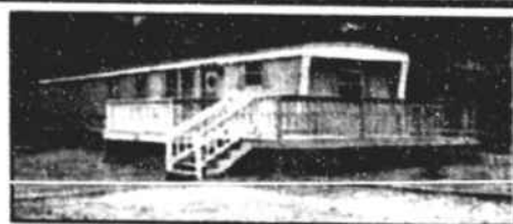
2 BR, 1 bath, outside storage, paved street. $20,000.