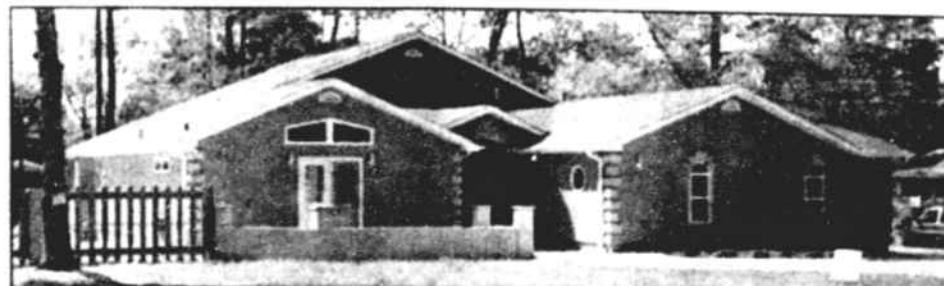
New home, 3 BR, 2 baths, approx. 2500 heated sq. ft. on 150x150 lot. Stucco exterior, screened-in porch, 18x36 fenced-in pool with fiberglass panels. Paved street, public water. Some financing. $198,500.