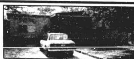
1986, 3 BR, 2 baths on 60x120 lot. Den add-on. $30,000.