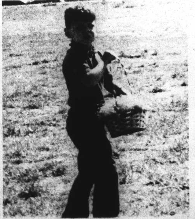
Recreation Dept. would like to thank all of the hunters and winners and hope to have a bigger and better hunt next year.

There were 100 students with 25 parents on hand. Again the