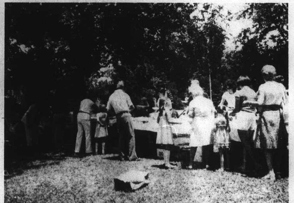
THE LINES WERE LONG — The lines were long and the food abundant during Oriental's Independence Day Celebration Sunday at the Mini-