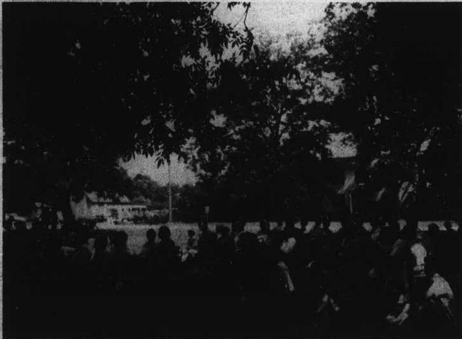
COMMUNITY CHURCH SERVICE — Oriental residents and many who maintain vacation homes there turned out in great number to at-