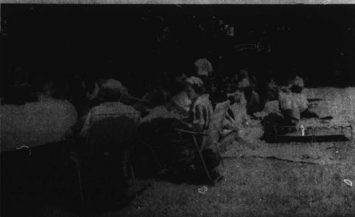
THE WEATHER COOPERATED — With sunny skies and just enough breeze to make it pleasant to sit around under shade trees