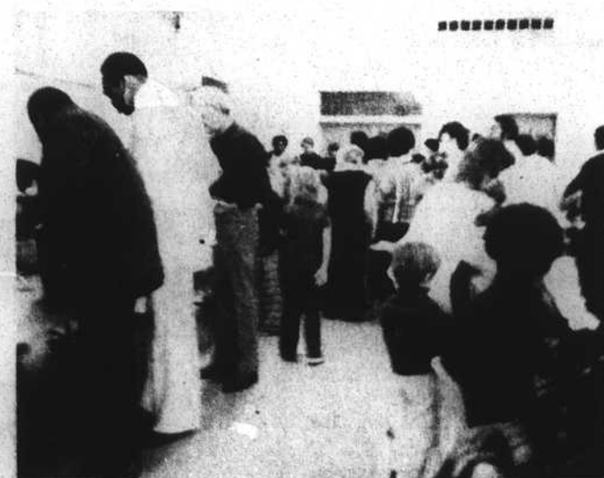
OVER 200 ATTENDED — Some of the over 200 parents, young people and friends attending the Flag Football Banquet in Bayboro Saturday, are shown serving themselves at the covered-dish dinner.