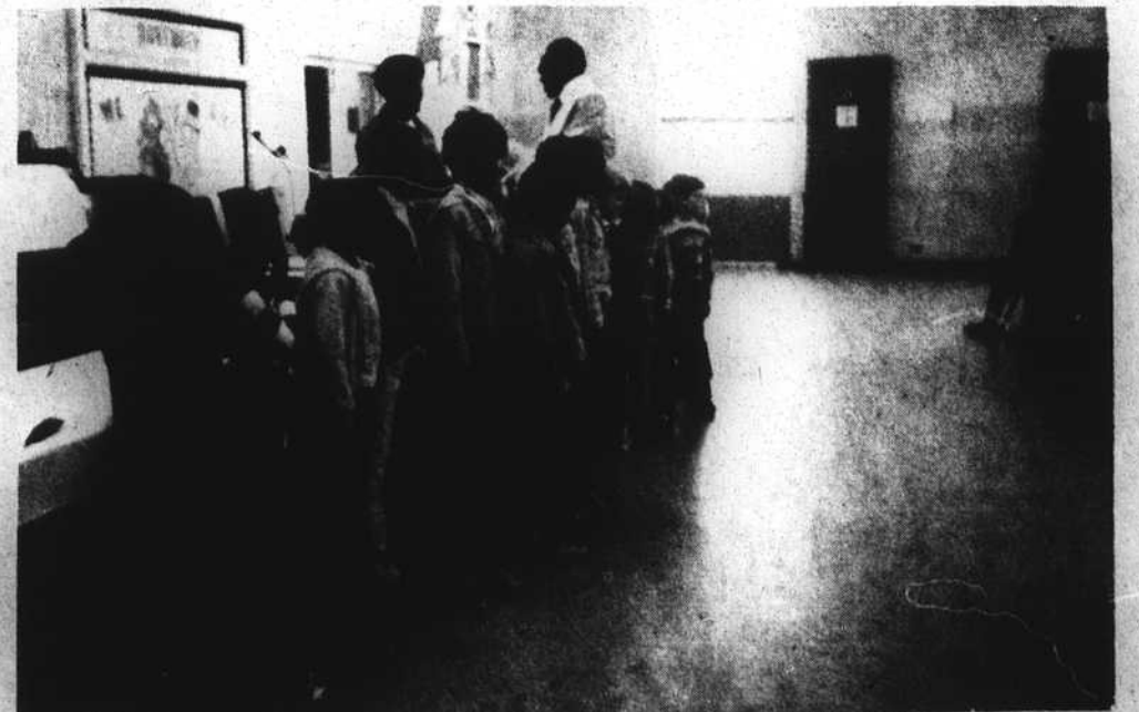
FIRST PLACE — The Oriental Tarheels were first place winners in the Pee Wees category and were given special recognition during the Recreation Commission banquet held recently at Fred A. Anderson School.