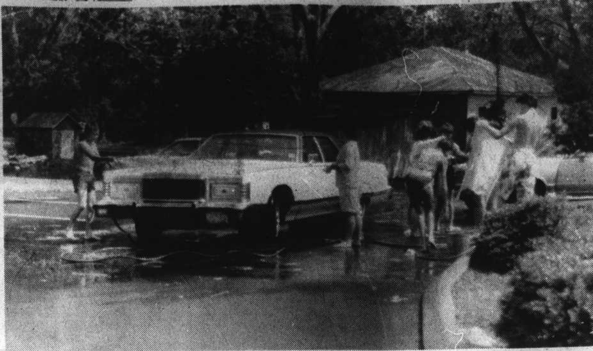
The Junior MYF of the Oriental United Methodist Church took advantage of the warm weather and holiday traffic Saturday morning to earn a little money for the building fund with a car wash. First Citizens Bank in Oriental offered their facilities.