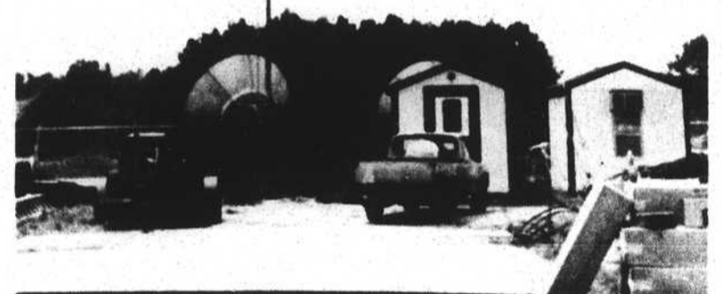
A tall antenna marks the new Alliance head-end site now providing parts of Pamlico County with cable television.

Expenses will leave $6,000 for the contingency fund and fund balance. Major expenditures include chemicals and supplies, $4,700; maintenance and repairs, $4,000; salaries, $5,849; bond payment, $12,750; capital outlay, $6,750; and water tank maintenance, $1,400.