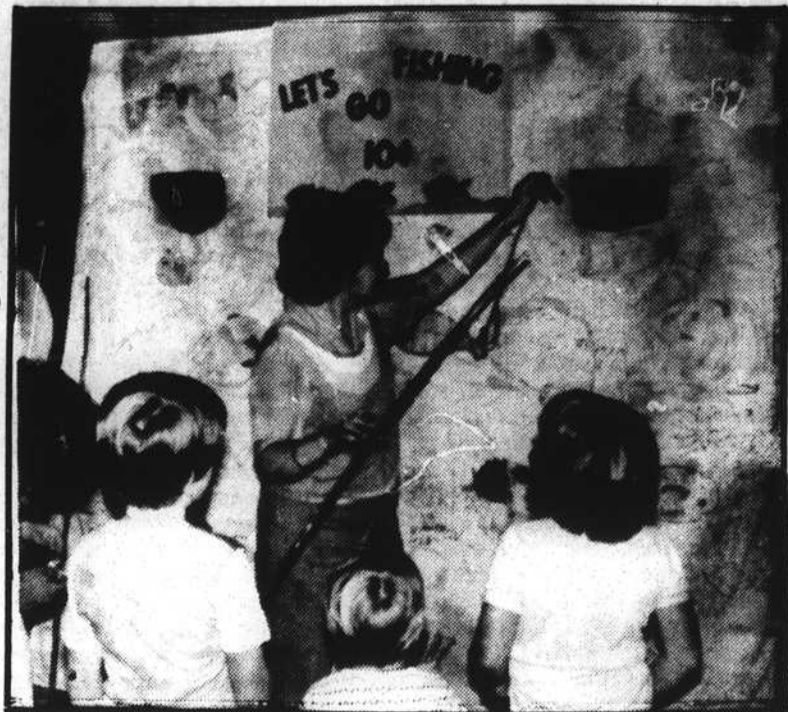
Aurora Harvest Festival.....Story Page 5-B

Monday, Nov. 17 Pamlico County Board of Commissioners - 7:30 pm, courthouse, Bayboro.