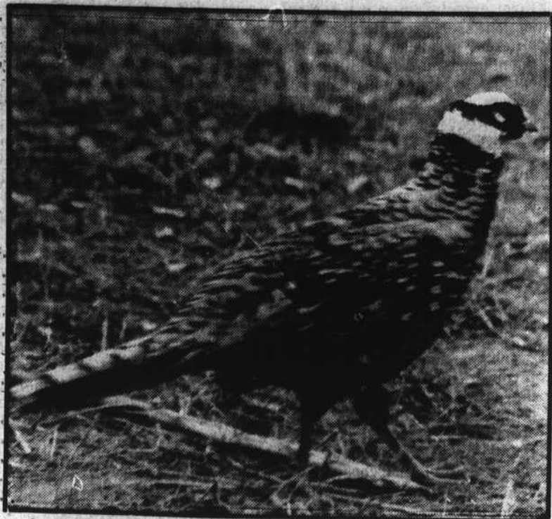
Ornamental Birds and Game Stock.....Story Page 4-A

0485 8706 1 PAMLICO TECH. COLLEGE PO BOX 185 GRANTSBORO NC 28529