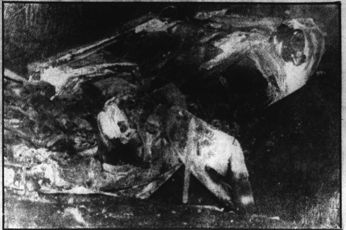
Three young men were thrown from this car last week before it began to burn.

Thursday, December 4 -Mesic Town Council, 7:30 pm, community building. Tuesday, December 9 -Minnesott Beach Town Board, 7 pm, town hall. -Bayboro Town Board, 7:30 pm, town hall. -Beaufort County Board of Education, 8 pm, administration building, Washington.