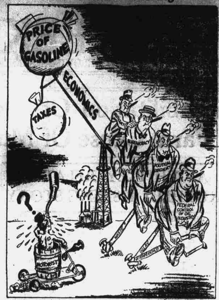
NEWS ITEM: "Oil trade association, petitioning Congress to avoid unnecessary interference and making NIRA an industrial dictatorship, warns that 'economic tinkering' and political control would increase gasoline prices and demoralize industry."

IE PERQUIMANS WEERLY, HERTFORD, N. C. PRIDAY, MAY SE