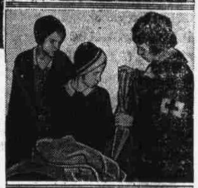
Red Cross than had been anticipated, Admiral Grayson urged that this three million dollar fund be exceeded by Chapters. Many responded by doubling and trebling their goals.

Admiral Cary T. Grayson, Chairman, notified President Roosevelt, who is President of the Red Cross, that a relief fund of at least $3,000,000 would be needed. President Roosevelt addressed a proclamation to the nation asking for liberal contributions. When double the number of families came under care of the