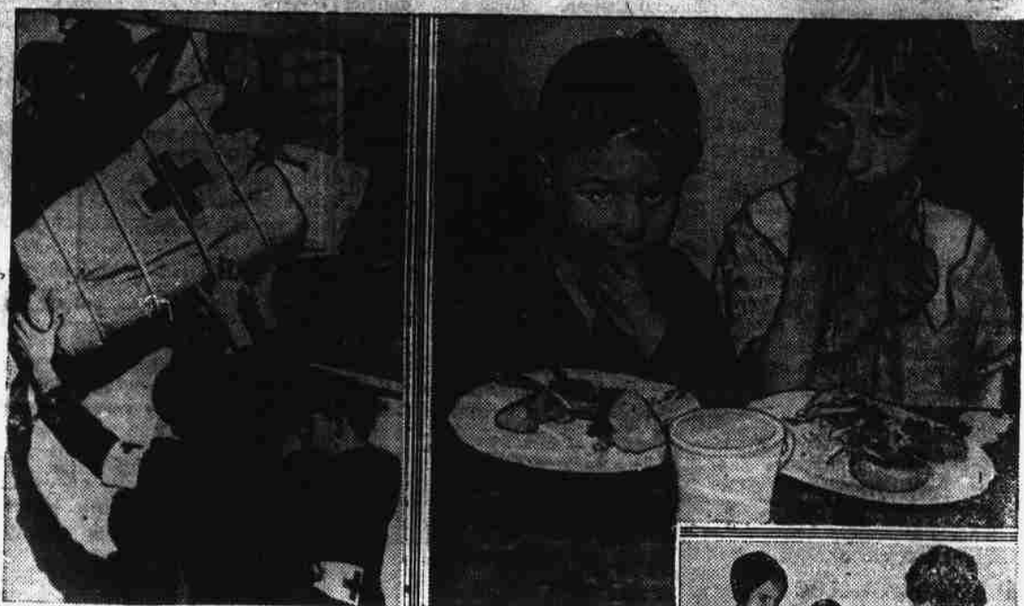
Left—A ton of baby food and blankets for infant flood refugees at Sunbury, Pa., sent by air. Upper right—Saddened by their plight little orphans of the storm sup at Red Cross food station in Pittsburgh. Lower right—Warm clothing was needed in Pittsburgh when zero weather followed floods.

The appalling floods that swept over eastern states during the middle of March caused the American Red Cross to take under its care more than 100,000 families in thirteen States. Pennsylvania was hardest hit, and in the cities of Pittsburgh and Johnstown the Red Cross either fed, sheltered or clothed 117,000 persons. The suffering was intense, because added to deluges of flood water, came rain, snow and intense cold.