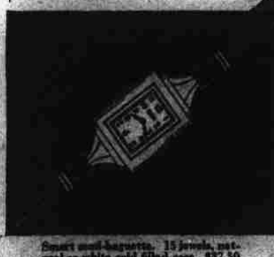
Smart steel-bracket. 15 jewels, natural or white gold filled case. $37.50

Come in today. You are sure to find "just the thing" for the bride-to-be you're interested in.