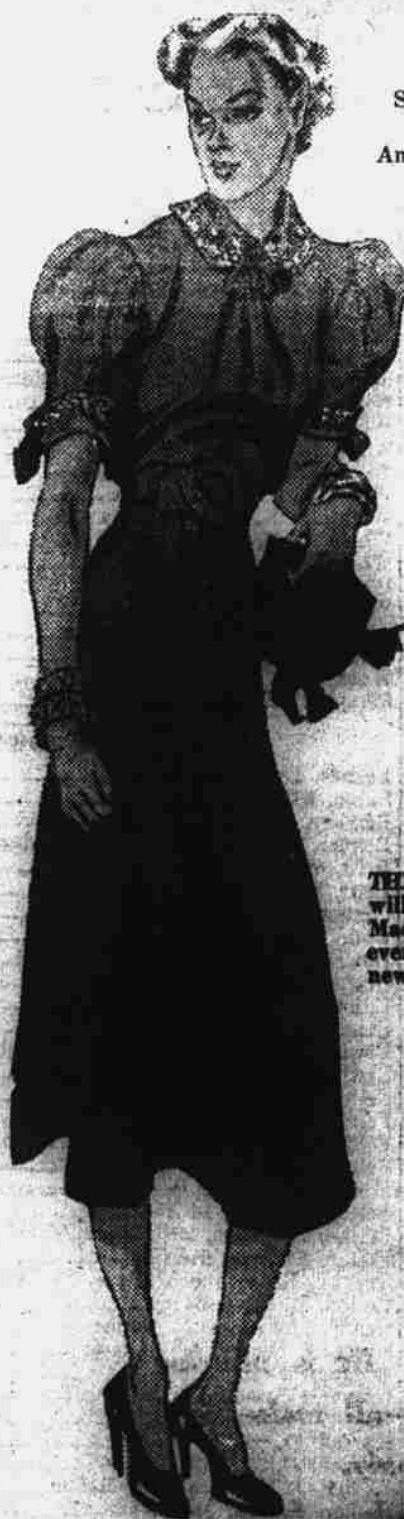
Sizes 12 to 52 And 16 1/2 to 28 1/2

New Arrivals Of DRESSES and Coats Each Week at SIMON'S