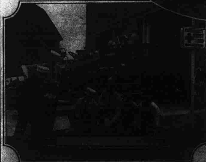
FIGHTING AUTOMOBILE DEATH TOLL —800 Red Cross Emergency First Aid Stations on the nation's highways, soon to be followed by 3,500 more, will reduce fatalities following motor accidents.