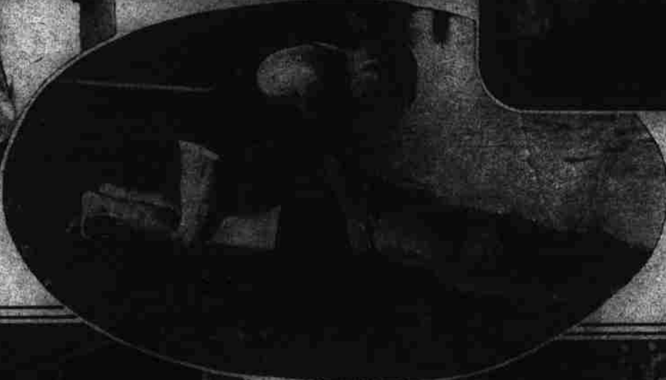
SAVING A LIFE —Red Cross Life Saver demonstrates prone pressure method of resuscitation of drowned person.