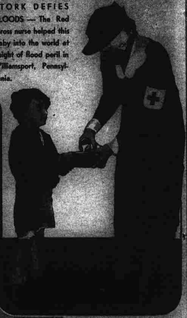
A WISTFUL LITTLE FLOOD REFUGEE —One of thousands of youngsters cared for by Red Cross volunteers in disaster-refugee centers.