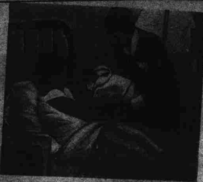
STORK DEFIES FLOODS —The Red Cross nurse helped this baby into the world at height of flood peril in Williamsport, Pennsylvania.