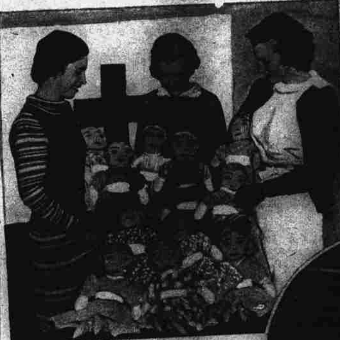
DOLLS BRING HAPPINESS —Junior Red Cross girls whose motto is "I Serve" make hundreds of rag dolls for children who have no toys.