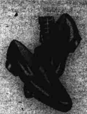
Slippers e ones for lounging