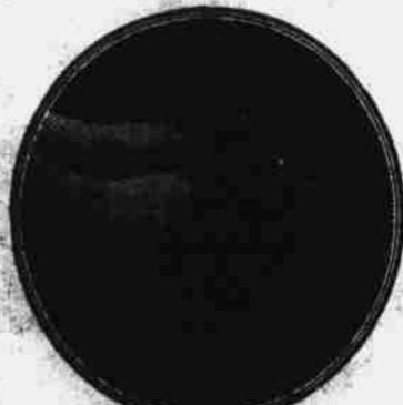
Chevrolet's Perfected Hydraulic Brakes are unbelievably soft and easy to operate—always dependable—always safe and positive in action.

THE NEW CHEVROLET is a modern car with PERFECTED HYDRAULIC BRAKES