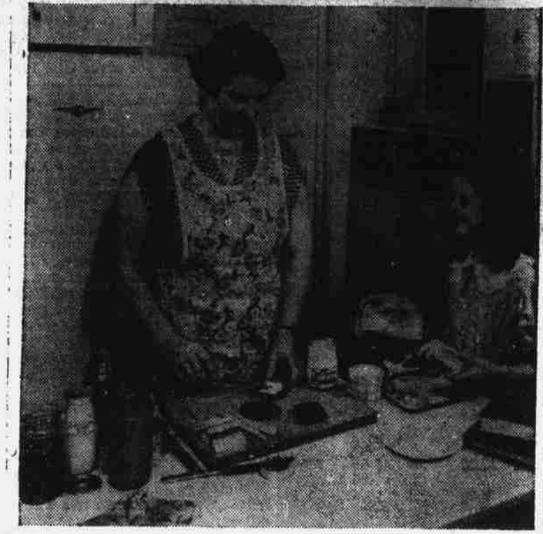
Children's Appetites Will Lag If Packing of School Lunches Permitted to Become Routine Affair

frequency. If the packing of the lunch is allowed to slip into a rut, the appetites at the consuming end are very spt to do the same, with the result that soon the growing children are going without many essential foods they need to carry on their school work and build strong healthy bodies.