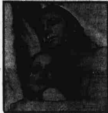
Dorothy Lamour and Jon Hall as the native sweethearts of "The Hurricane."

The South Sea Island unit of Samuel Goldwyn's "The Hurricane" company returned to Hollywood with 140,000 feet of film to show for 9,000 miles of location travel.