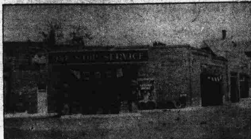
The One-Stop Service Station on U. S. Highway 17, at Grubb and Church streets, maintaining 24-hour service. Controlled by the Winslow Oil Company, Shell distributors, the One-Stop is one of several such stations in this section, rendering top-notch auto service.