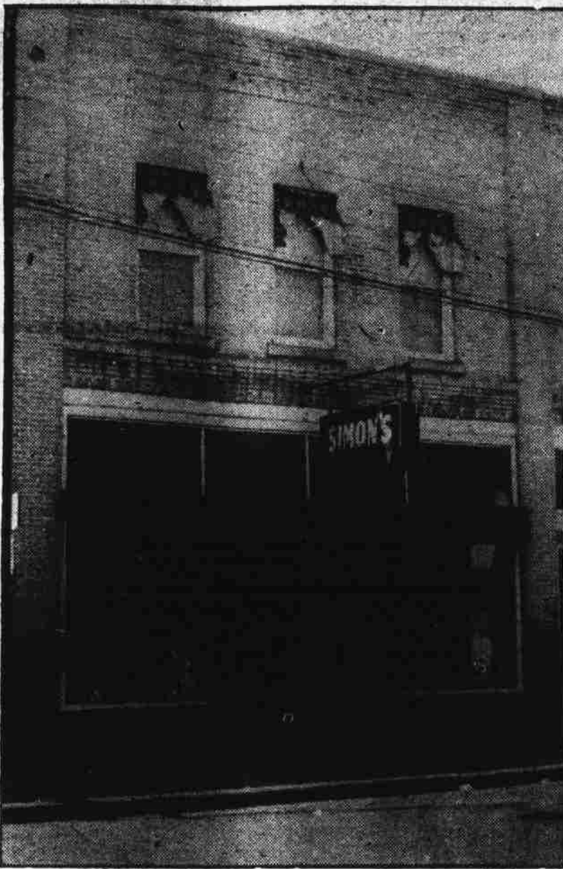
The store of Simon Rutenberg on Church Street in the principal shopping district. The second floor department displays exclusively ladies' and children's wear. The ground level of this modern establishment is given over to shoes and men's and boys' clothing.