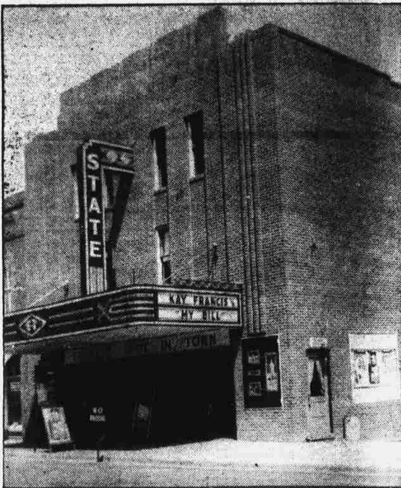
View of "The finest theatre in North Carolina," built on Church Street, less than two years ago by the Carolina Amusement Company. The State Theatre is one of Eastern Carolina's most popular movie houses.