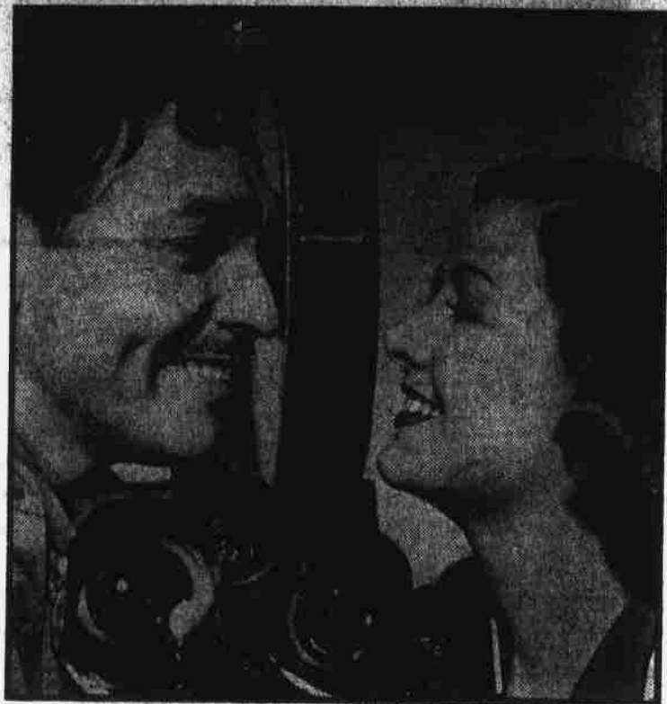
Clark Gable and Myrna Loy in "Too Hot to Handle"

Clark Gable and Myrna Loy as daredevils under fire, provide thrills, romance and action-packed drama in "Too Hot to Handle," story of the daring feats of newsreel cameramen, which will be shown at the State Theatre Monday and Tuesday, gets off to a flying start in Shanghai.