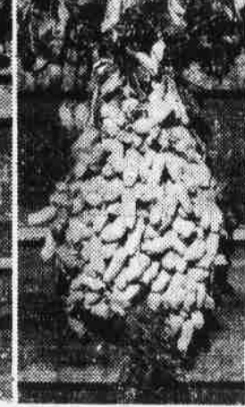
NITROGEN PHOSPHORUS POTASH