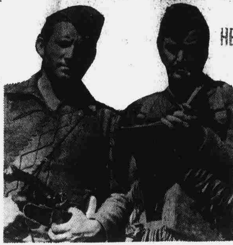
Spencer Tracy and Robert Young in "Northwest Passage" in Techni- color at State Theatre, Hertford, Monday and Tuesday. A show that puts the wildest fiction to shame.