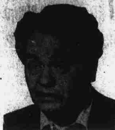
Edward G. Robinson in "Brother Orchid" at State Theatre, Hertford, Monday only.