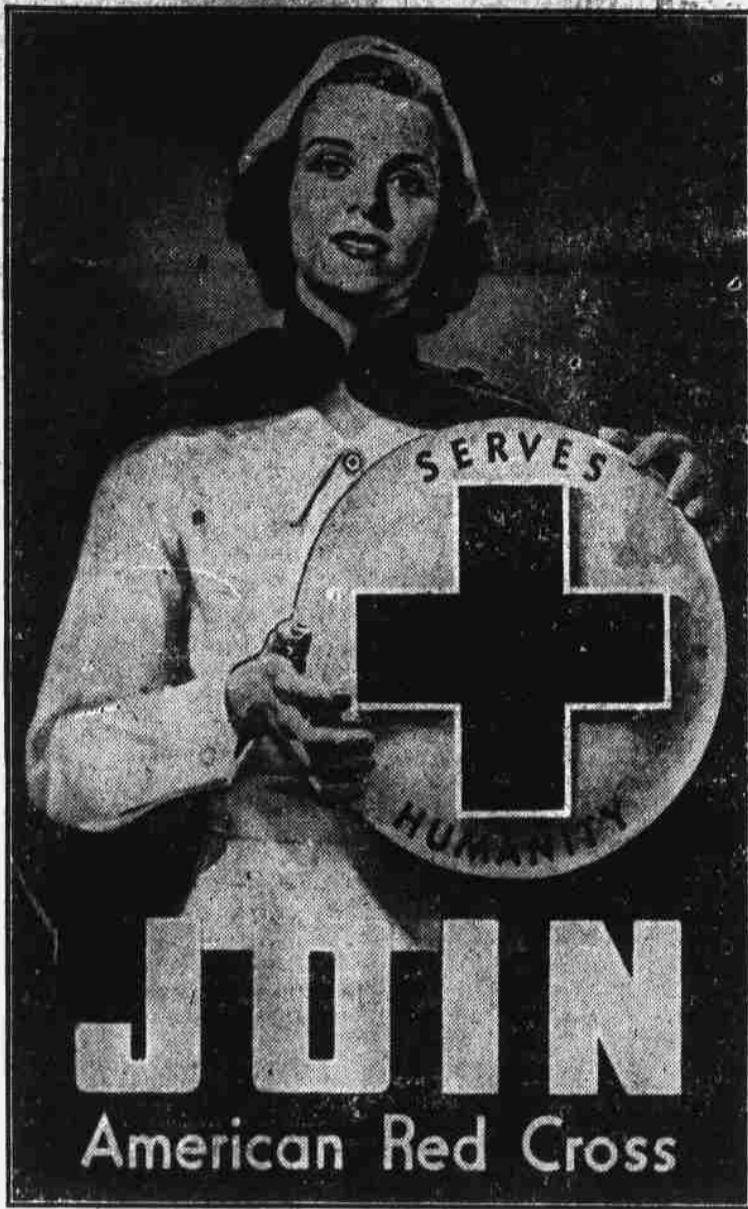
The 1940 Poster of The American Red Cross sounds the call to the nation to serve humanity within the ranks of this army of mercy.