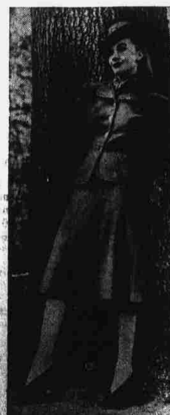
For wear all fall, and during the winter months under fur coats is a long trend and seen in the October Good Housekeeping. Its special features are a lined jacket and gloves, both priced to meet the limited demand.