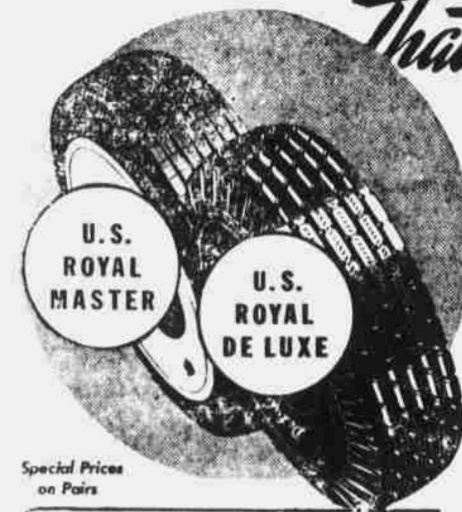
Special Prices on Pairs

BE SAFER—SAVE MONEY RIDE ON THESE World-Famous U.S. SAFETY TIRES