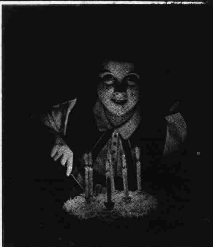
Easy to take—just a short time exposure with the camera on a firm support—this shot is part of a charming birthday series. Keep your camera busy on birthdays; they're fine for pictures.

SOONER or later, every member of a family has a birthday—and here is one occasion when you can really turn your camera loose for a first-rate story-telling series of pictures. Of course, the center of a child's birthday is the cake with candles. That's why we picked it for our picture here. But there's a lot more to a birthday—anybody's birthday. The preparations—the presentation of gifts—the party, if there is one—all these make good snapshot material. If it's a child's occasion, with your small son or daughter playing the leading role, you can start taking pictures several days in advance—pictures emphasizing the good behavior that always precedes the big day. The idea, in making a series of this sort, is to tell a complete story. The more details you can show, the better your story—and it's more satisfying when you look back through your album. Here's what I mean by "details." Suppose it's Dad's birthday, and you're giving him a new pipe. Then