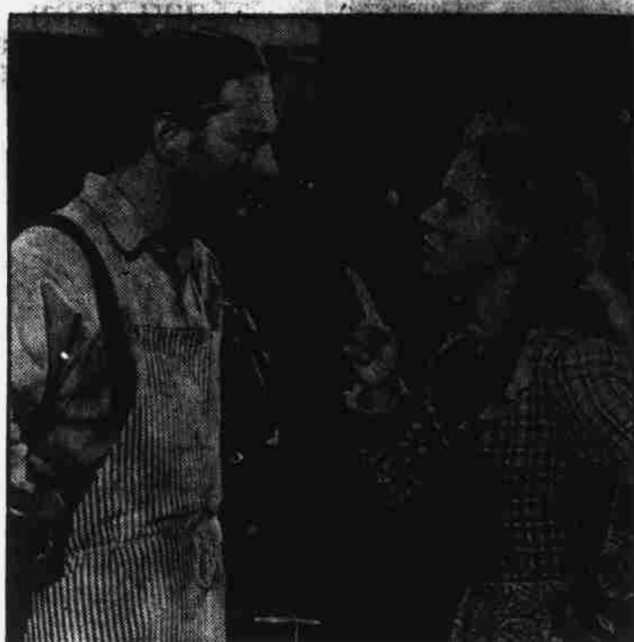
William Gargan and Martha Scott compose the starring duo in the Richard A. Rowland production, "Cheers For Miss Bishop," the stirring dramatic romance at State Theatre, Hertford, Wednesday.