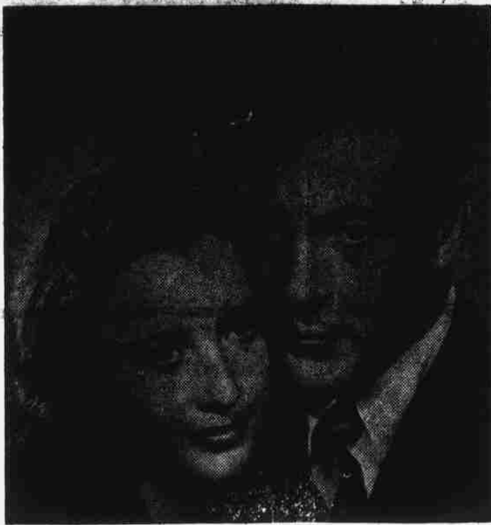
Warner Brothers' outstanding attraction, "Meet John Doe," starring Gary Cooper and Barbara Stanwyck, comes to the State Theatre, Hertford, Monday and Tuesday, September 15 and 16.