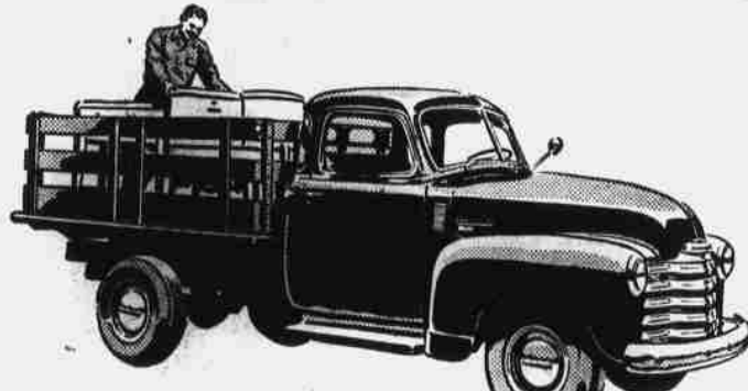
MEDIUM-DUTY DE LUXE STAKE* Model 3609—125 1/4-inch wheelbase, Maximum G.V.W. 5,800 lb. Other models available up to 161-inch wheelbase and 16,000 lb. G.V.W.

If what you want is the truck that will deliver the most for the money—then what you want is a Chevrolet truck. If what you want is sterling quality, outstanding load capacity and performance with power plus economy—then you're dead right in choosing a Chevrolet truck. And if you want all these advantages at lowest cost, you definitely want Chevrolet, for only Chevrolet trucks have 3-WAY THRIFT—lower cost operation and upkeep and the lowest list prices in the entire truck field!