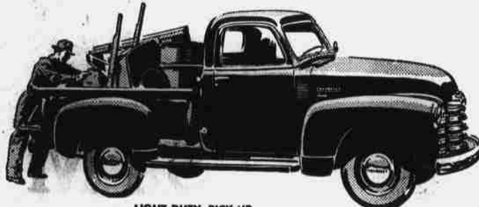
LIGHT-DUTY PICK-UP Model 3104—116-inch wheelbase, Maximum G.V.W. 4,600 lb. Other models available: 3604—125 1/4-inch wheelbase, Maximum G.V.W. 5,800 lb; 3804—137-inch wheelbase, Maximum G.V.W. 6,700 lb.