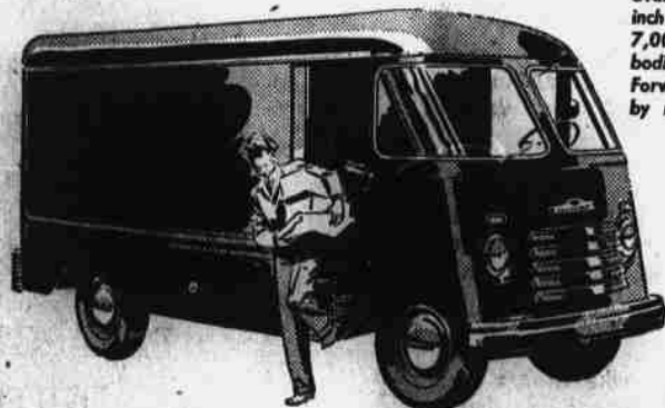
*De luxe equipment optional at extra cost.

Model 3942—137-inch wheelbase, Maximum G.V.W. 10,000 lb. Also available in model 3742—125 1/4-inch wheelbase, Maximum G.V.W. 7,000 lb. Package Delivery type bodies suitable for mounting on the Forward-Control Chassis are supplied by many reputable manufacturers.