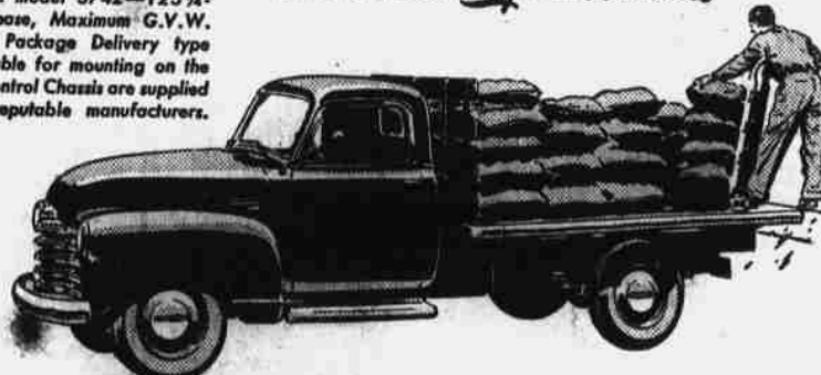
MEDIUM-DUTY CAB AND CHASSIS WITH PLATFORM BODY Model 3808—137-inch wheelbase, Maximum G.V.W. 8,800 lb. Other models available up to 161-inch wheelbase and 16,000 lb. G.V.W.

More Chevrolet Trucks in use than any other make