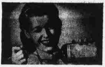
There are no harmful opiates in Pinkham's Compound—it is made from nature's own roots and herbs (plus Vitamin B.). IT HELPS NATURE. Also a fine stomachic tonic! Follow label directions. Worth trying!

Take heed if you, like so many women and girls on such days suffer from cramps, headaches, backache, weak, nervous feelings, distress of "irregularities"—due to functional monthly disturbances. Start at once—try Lydia E. Pinkham's Vegetable Compound to relieve such symptoms because this famous medicine has a soothing effect on one of woman's most important organs. Taken regularly throughout the month—it helps build up resistance against such symptoms. Thousands upon thousands of women report benefits!