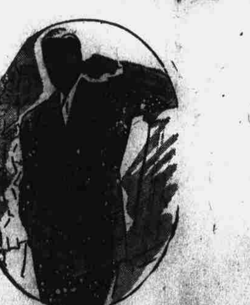
A Leisure-Time Sport Coat

You'll feel as relaxed as you - Assis Suor Time sign up sool ed ahirt can be worn in-orout. Matching slacks. Light blue or tan colors. Waist sizes 29 to 40.