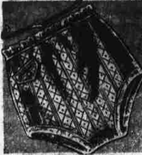
All Wool Swim Trunks Novelty Weave $1.49 to $3.98

$1.29 to $2.98 washable cotton Small, medium, Colorful,