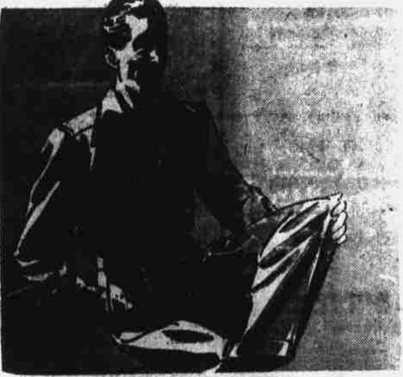
Get Around In A Slack Suit

Cool, Comfortable, Well-Made Tropical Cloth Goes Lots Of Places In Free-and-Easy Style