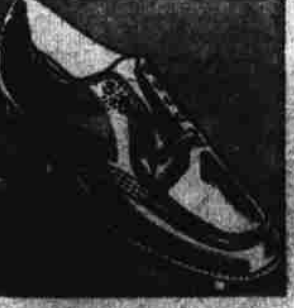
Men's Moccasin Shoes In Army Russet $5.00 Medium toe, corded mosca-sin vamp. Leather soles. 7 to 11.