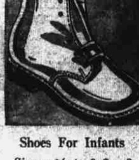
Sizes 51/2 to 8 $1.98 Plain toe bluchers of plump kid with spring heel.