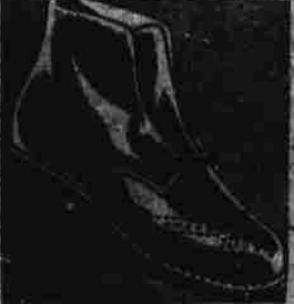
School Pal Shoes Sizes 10 to 3 $2.98