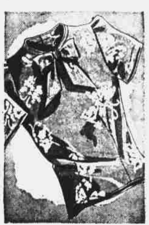
"Kathryn Gray" Blouse $3.49