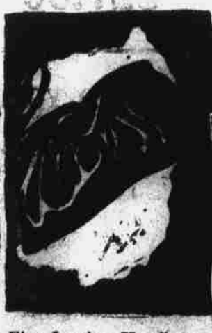
Fine Leather Handbags $4.98

J. C. BLANCHARD & CO., INC. "BLANCHARD'S" SINCE 1832 HERTFORD, N. C.