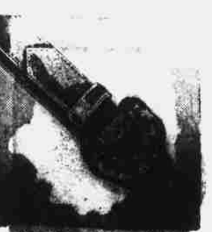
Smart Lambskin Belt 98c