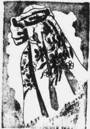
Oblong Ninon Scarf $1.98