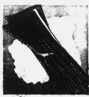
Hand-tailored Gloves $1.98