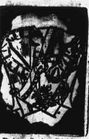
Dainty Spring Dickies $1.98