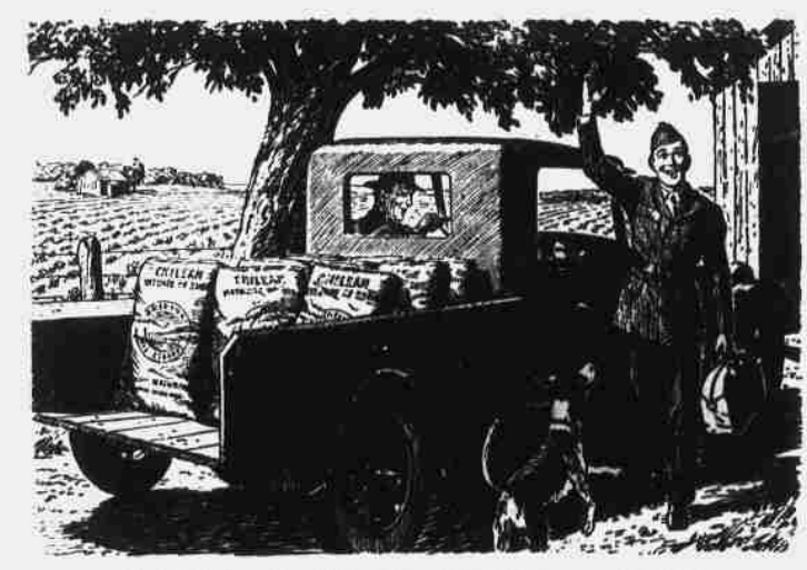
Doubly Lucky...Pop brings home a soldier son on furlough and natural nitrate to side dress the crops.

Preference for Chilean Nitrate is Just as Natural as the Product Itself