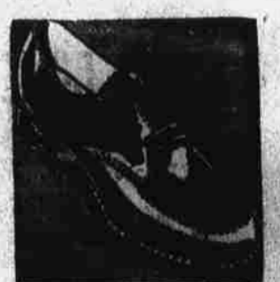
Barrington Sport Shoes

"Valor Tru-Pals" quality. Assorted colors. Small, medium, large.