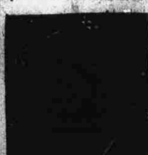
Belt-Style Swim Trunks

Dress slacks of cotton slub suiting. Tan or blue. Sizes 6-16.