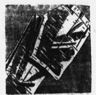
"Valor Tru-Pals" Slacks

Short sleeves with Windsor-style collar. Assorted colors.