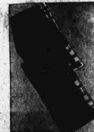
Sturdy Corduroy Slacks Plaid Patterns $3.98 With front pleats and finished cuffs. Blue or brown, 6-16.

Designed for good going, and made extra snug with full plaid lining plus streamlined zipper front. In brown, with belted back, 6 to 12. Sizes 14 to 18 available at $9.98. 9.98