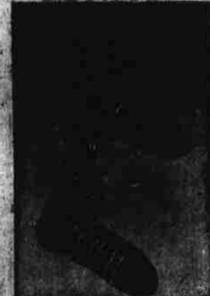
"Hamway" Crew Socks Heavy Weight 35c Dashing striped patterns in bright fall colors! 8 to 11.