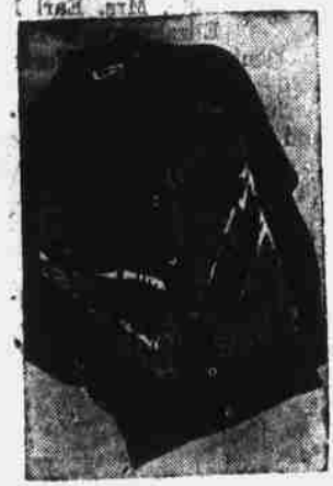
Two-Tone Coat Sweater "Valor" $1.98 Sturdy wool, cotton and rayon blend. For junior boys, 4-10.