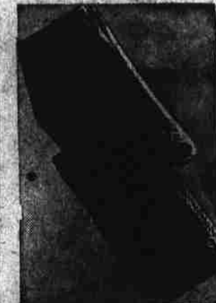
Tailored Dress Slacks Wool and Rayon $4.98 Herringbone pattern, zipper front. Blue or brown, 6-16.