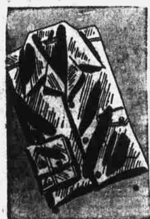
Gabardine Sport Shirt Long Sleeve $2.98 Sty!e! In popular shade of blue, with convertible 2-way collar. 6-16.